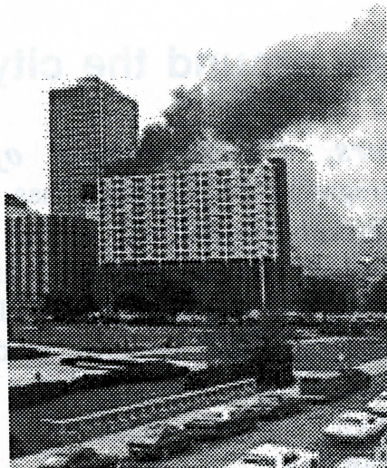
Rault Center fire November 29, 1972.